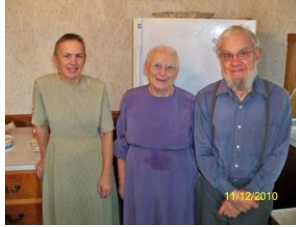
The Mullet Family